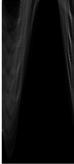
Figure 2: Hough transform result.